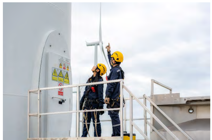
Figure 1 – Access to the nacelle requires special training and equipment.

This windfarm operator wanted an online monitoring system that could detect faults that would allow them to schedule maintenance before more serious problems developed. Time-base maintenance was often performed on healthy systems and was costing the operator valuable resources that could be deployed for more urgent issues. The operator was familiar with infrared technology and how it could be used to detect hotspots in electrical systems. Infrared sensors detect the excess heat emitted through arcing in failing insulation or poor electrical connections. Infrared technology is a proven technology that has long been used by utilities for inspections of transformers, busbars, breakers, switches and other primary and secondary substation equipment. Additionally, infrared sensors can detect faults in other electrical and non-electrical wind turbine sub-systems such as the generator, gearbox, bearings, and cooling system. Major benefits of infrared sensors are that they are non-invasive; no physical connection is required to acquire the readings and secondly the system can be operational and under load during the thermal