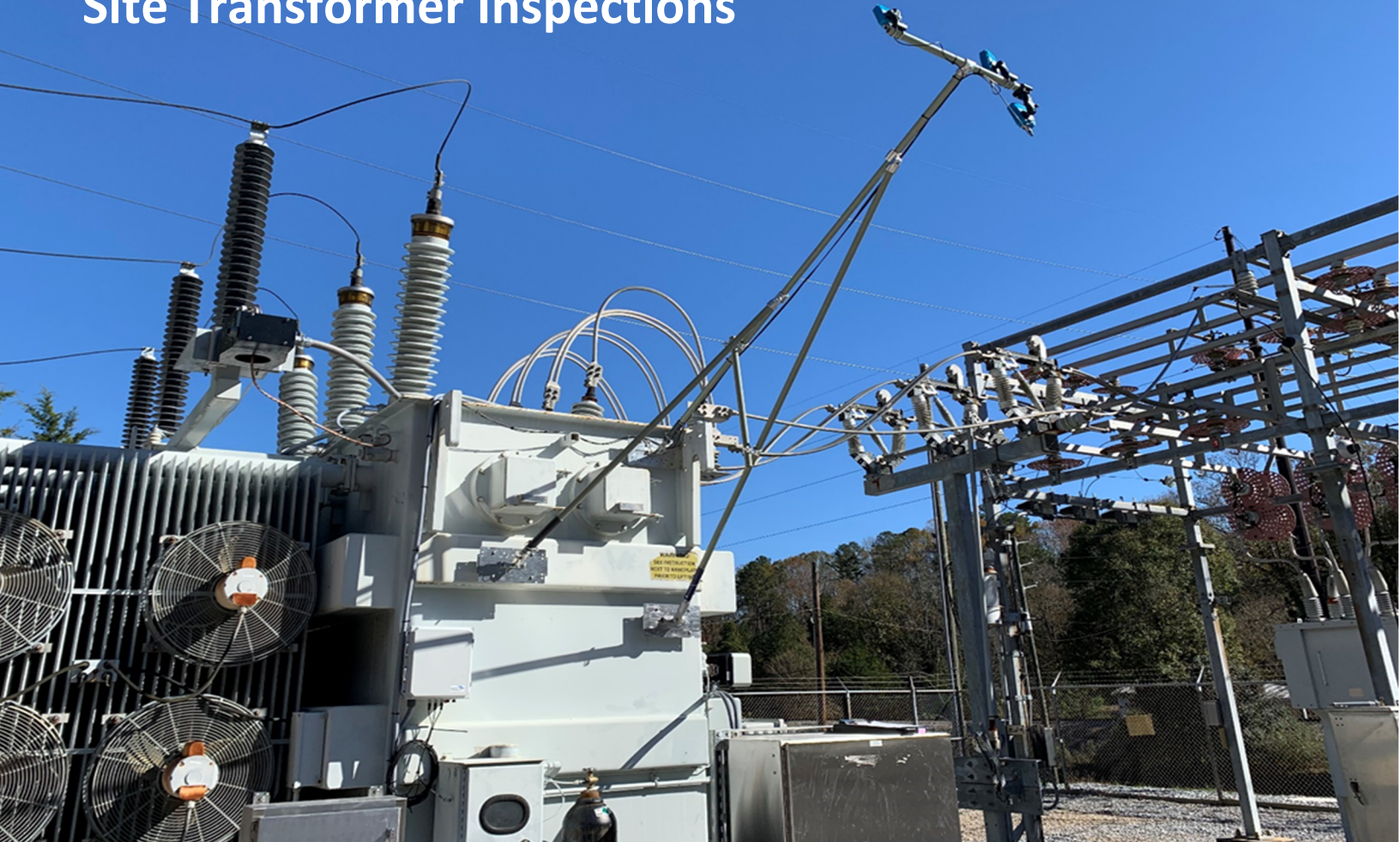
Figure 1 – IM500 Quick Mount installed on Southern Company transformer.